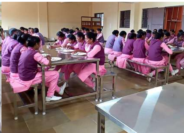
JCC Students taking their Lunch