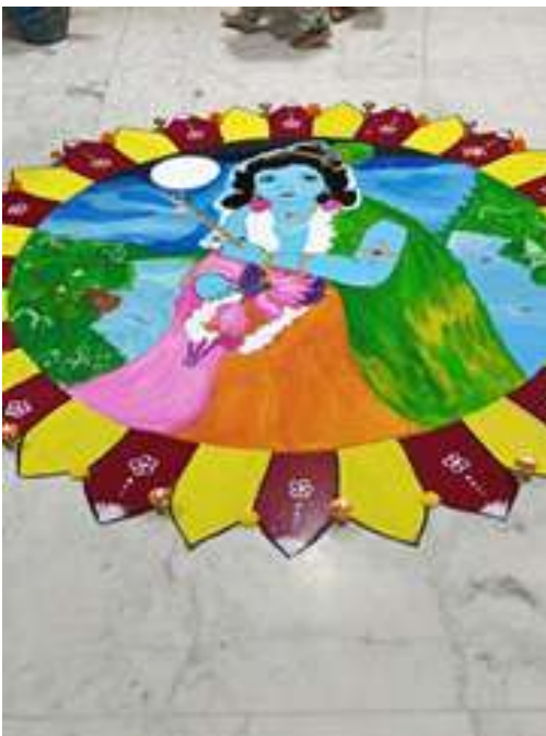
Rangoli of Krishna