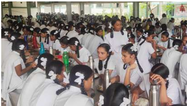
Students of RVN having their Lunch