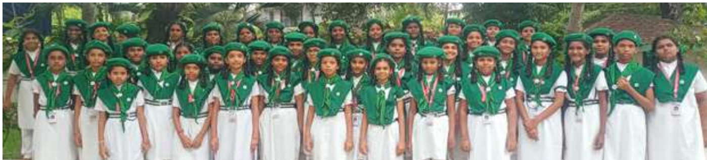
National Green Corp

1. Disposal of Solid waste 2. Water conservation 3. Air Pollution 4. Biodiversity Conservation 5. Plantation campaigns 6. Climate change 7. Development of environment friendly attitudes among people 8. Study of eco systems and important role-played by biodiversity in our lives.