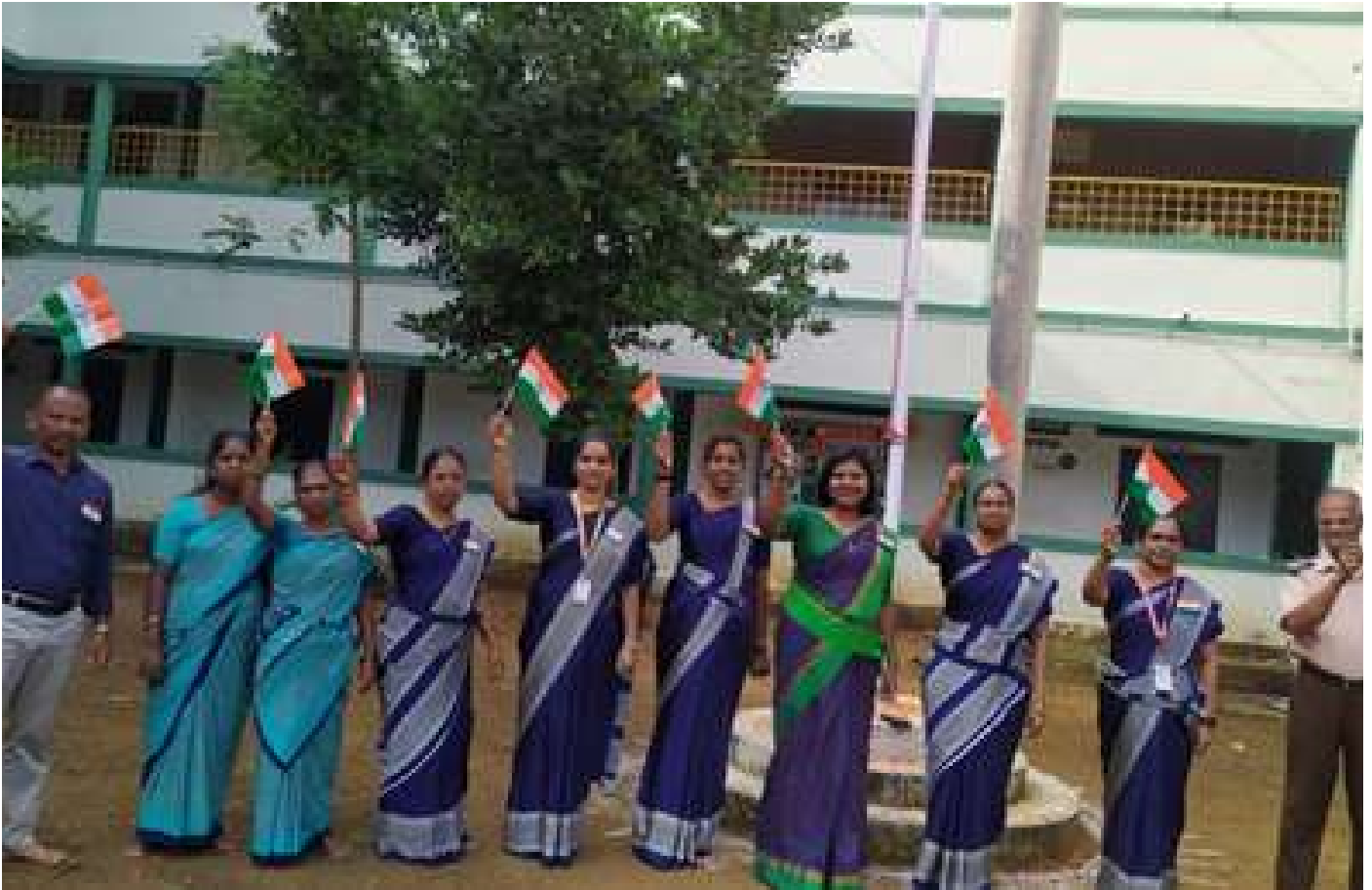
Independence day Celebrated at RVN School

Our RVN celebrated its Independence Day on 15 th of August 2023 this year, and it remains of all the sacrifices that were made by our freedom fighters to make India Free from British Rule. It was decided to conduct activities for all the RVN's to mark the victory and pride of free India. Students from all the classes actively participated in all competitions conducted on the day by the team of Teachers. And the prizes were distributed to all the winners on Sep 6 2023.