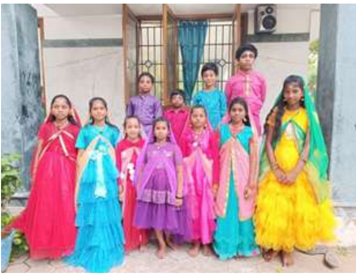
Resident children in a traditional attire