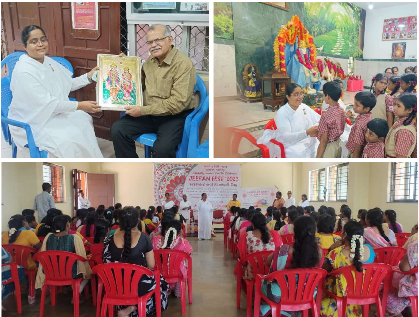
Brahmakumaris team in JC