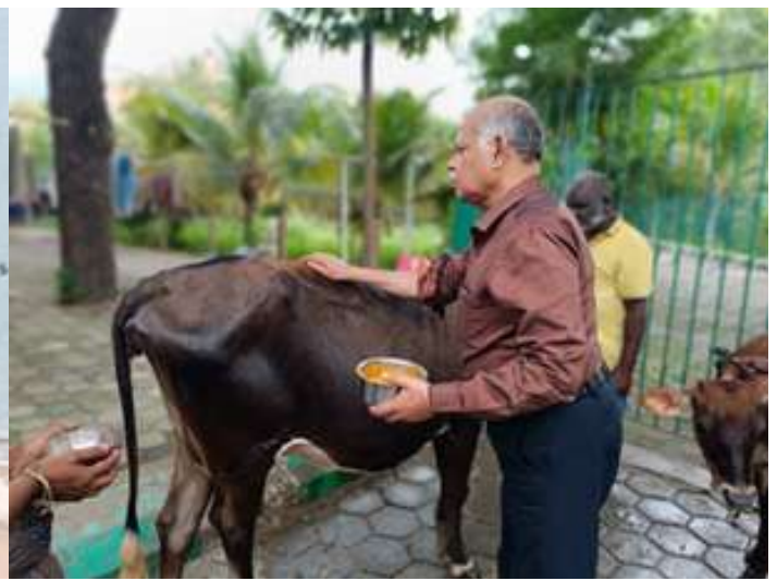
Pappa performing ritual to the cattle